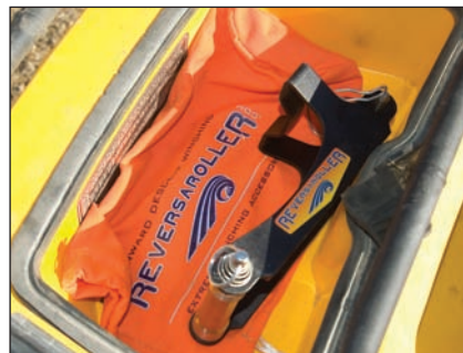
When not in use, the ReversaRoller stows away in the Can-Am's storage compartment in its own protective bag.