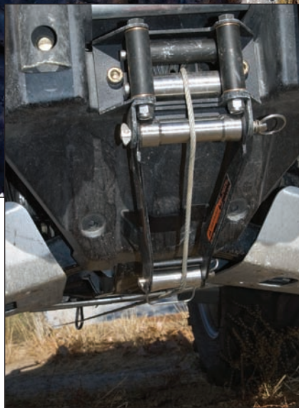
We have already used the ReversaRoller to explore new sections of our favorite ride area. Now, trails that were only passable on a dirt bike or on foot can be explored on our quads.

The ReversaRoller installs in minutes, replacing your winch's fair lead. It's made of quality materials that will add value to any utility quad.